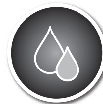
Fill with water