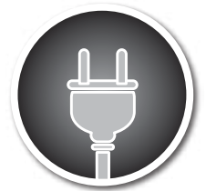
Plug in 120V (convertible 240V*)