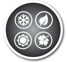
4 seasons insulation