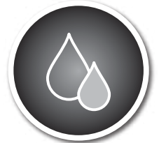
Fill with water