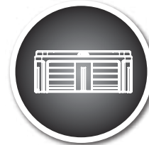
Put in place*