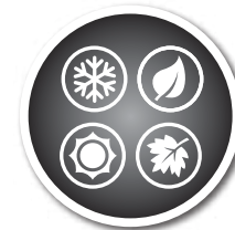
4 seasons insulation