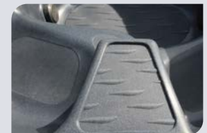
Unique Seating Layout