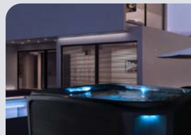
LED Ambiance in Lighting