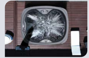
No Hassle Installation**