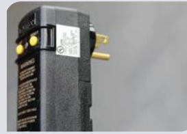
Plug & Play 120V / 240V Convertible*