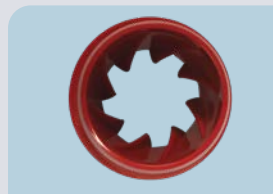
InnovaFlow Friction Heating