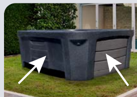
Very Wide, Removable Dual-Access Panels