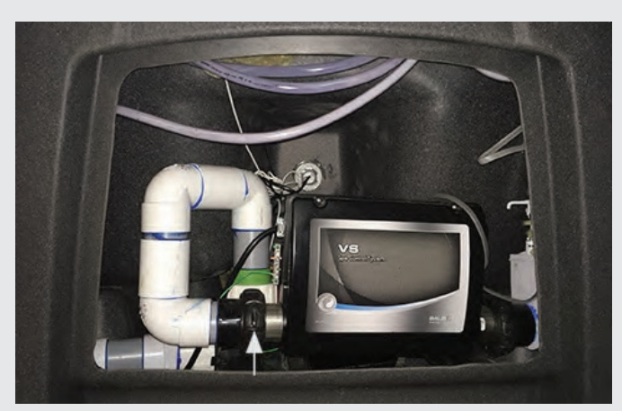
FIGURE 1.9a: HEATER UNION; LOOSEN UP TO BLEED AIR