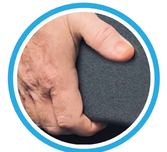
Easy transport with integrated handles