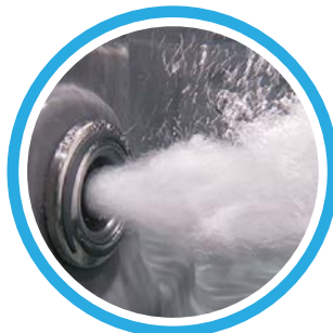
Powerful Whirlpool* jet with water flow management