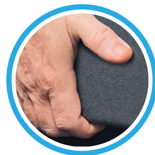
Easy transport with integrated handles