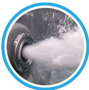
Powerful Whirlpool* jet with water flow management