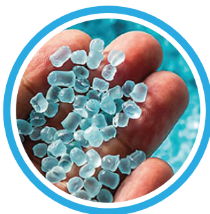
One-piece polyethylene construction