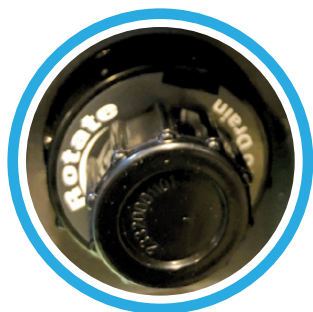
External drain valve

Images for reference only. Colors, specifications and location of the whirlpool* jet may vary (optional).