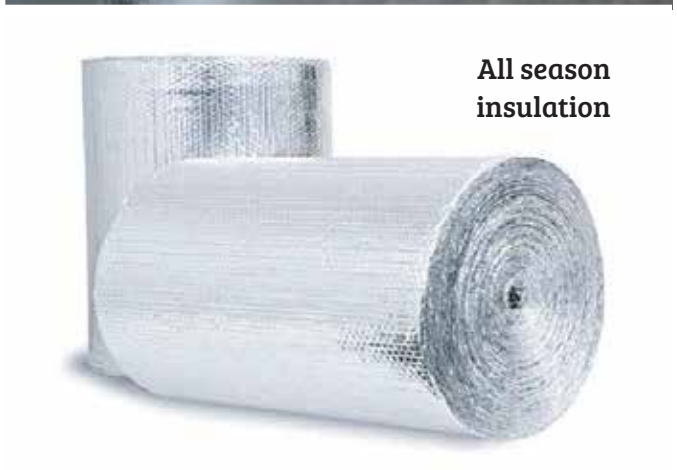
All season insulation