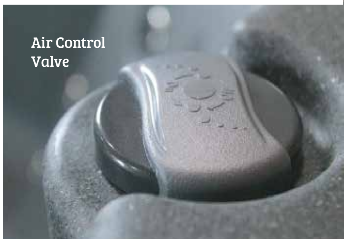
Air Control Valve