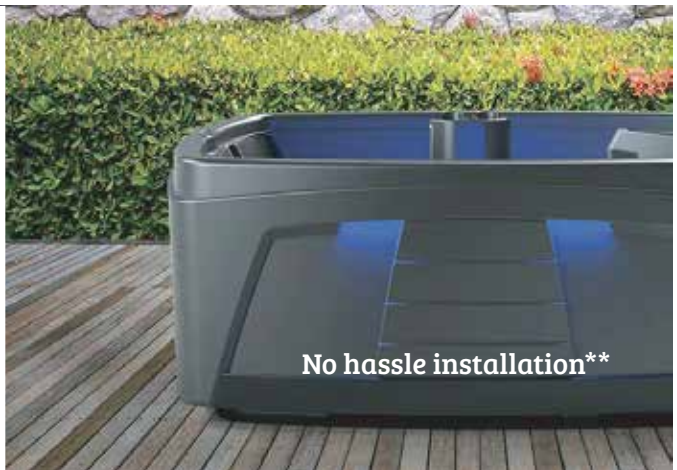
No hassle installation**