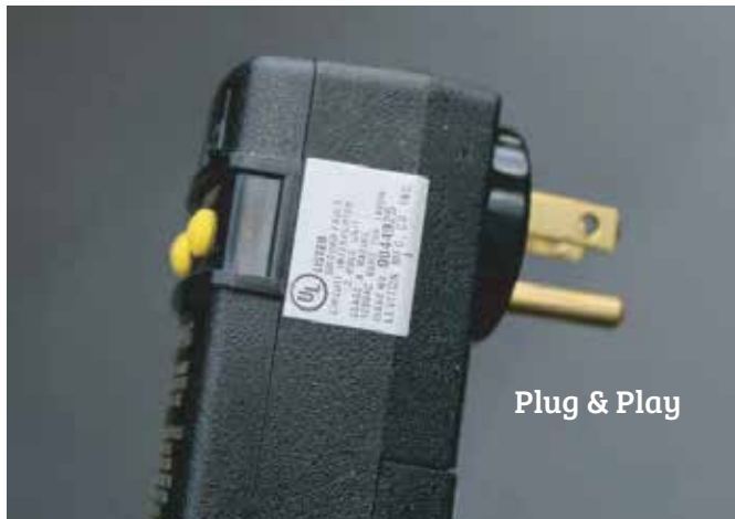
Plug & Play